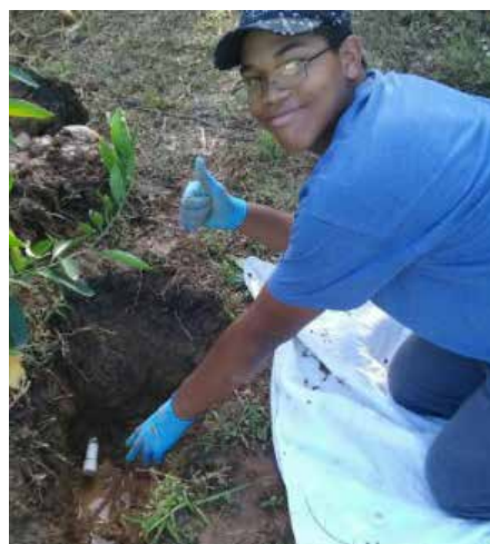
Scenes from Carver High School students in Science class and Gardening classes, gathering seeds and planting