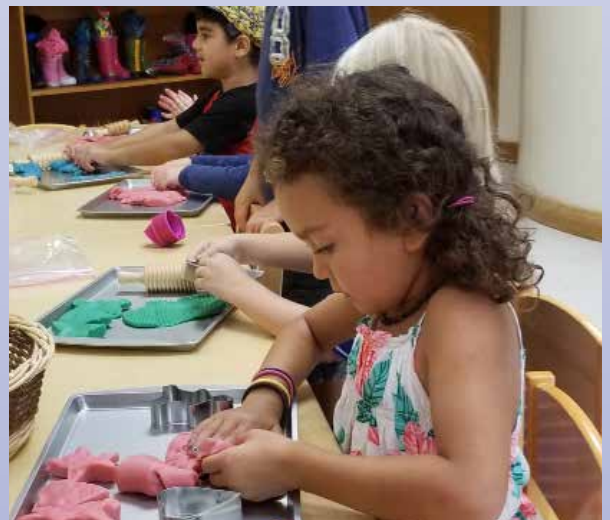
Scenes from the early grades at Seaside Community School in Florida.