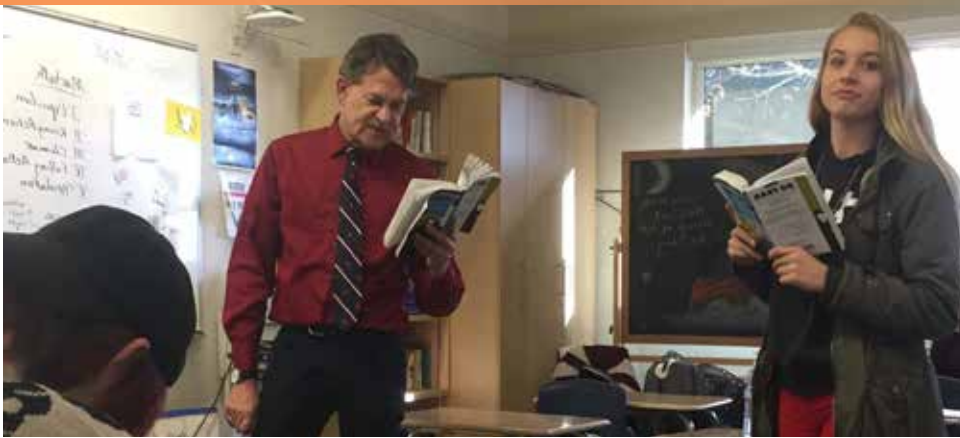
Studying Macbeth at Carver High School of Arts & Sciences, in Northern CA