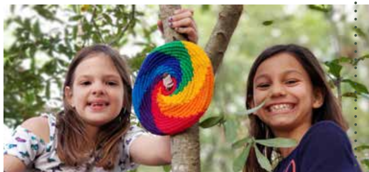
Seaside students enjoy a nature-rich campus.

Your teen will experiment; they must. They explore through the Waldorf curriculum, through field trips, through work and internships, through experimentation and sometimes risk. These activities give high school students opportunities to find new authorities in their lives, like a real boss. As Twain complained about his parents Continued on page 10